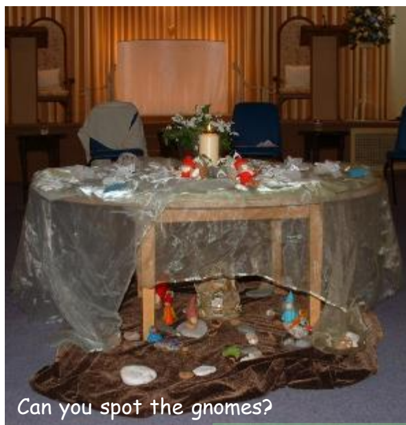
Can you spot the gnomes?