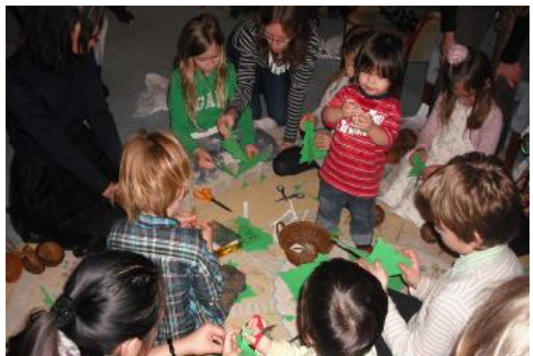
Christmas seems a long time ago now but this was a picture from our Christmas party when we were busy making Christmas trees

completed the booking form and sent in their deposit please do so as soon as possible.